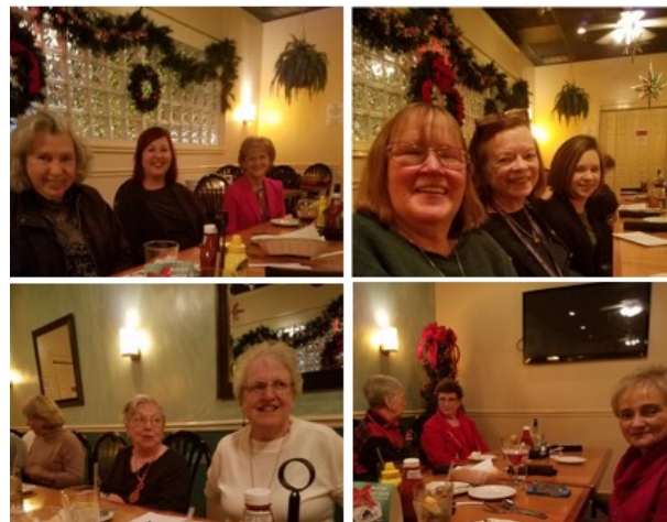
December 2018 Alumni Winter Gathering