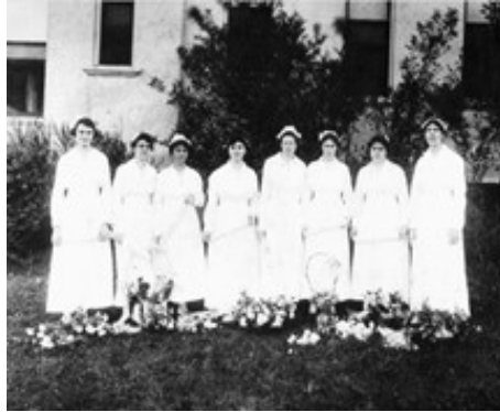
Class of 1919, Photo courtesy of the Watts History Project