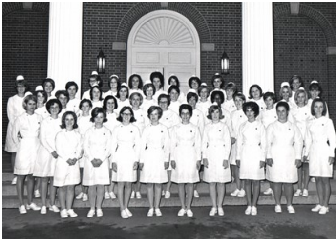
Class of 1969