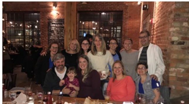
Members from the Class of December 2012 and May 2013

This award shall be given at each graduation ceremony to a senior student who shall be selected by the faculty of the Watts School of Nursing. The recipient of the award shall be an outstanding student who displays a genuine dedication to nursing, in addition to devotion and loyalty to the school of nursing through his/her education performance and participation in student activities. The student displays a focus on the school, organization, and extracurricular activities.